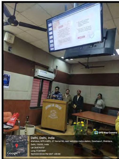
Delhi, Delhi, India shahdara, M7F+MP2, GT Karnal Rd, near welcome metro station, Dwarkapuri, Shahdara, Delhi, 110032, India Lat 28.674372° Long 77.281966° 16/01/24 02:44 PM GMT +05:30