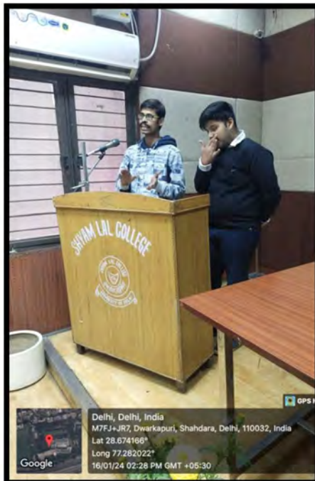
Delhi, Delhi, India M7F+JR7, Dwarkapuri, Shahdara, Delhi, 110032, India Lat 28.674166° Long 77.282022° 16/01/24 02:28 PM GMT +05:30