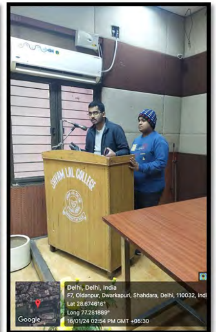
Delhi, Delhi, India F7, Oldanpur, Dwarkapuri, Shahdara, Delhi, 110032, India Lat 28.674616° Long 77.281889° 16/01/24 02:54 PM GMT +05:30