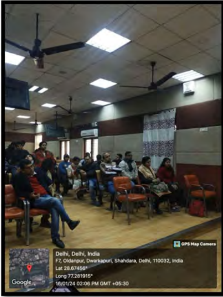
Delhi, Delhi, India F7, Oldanpur, Dwarkapuri, Shahdara, Delhi, 110032, India Lat 28.67456° Long 77.28191° 16/01/24 02:06 PM GMT +05:30