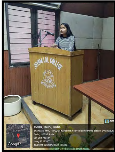
Delhi, Delhi, India shahdara, M7F+MP2, GT Karnal Rd, near welcome metro station, Dwarkapuri, Delhi, 110032, India Lat 28.674348° Long 77.282007° 16/01/24 02:36 PM GMT +05:30