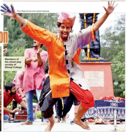
Members of the street play society of Shivaji College