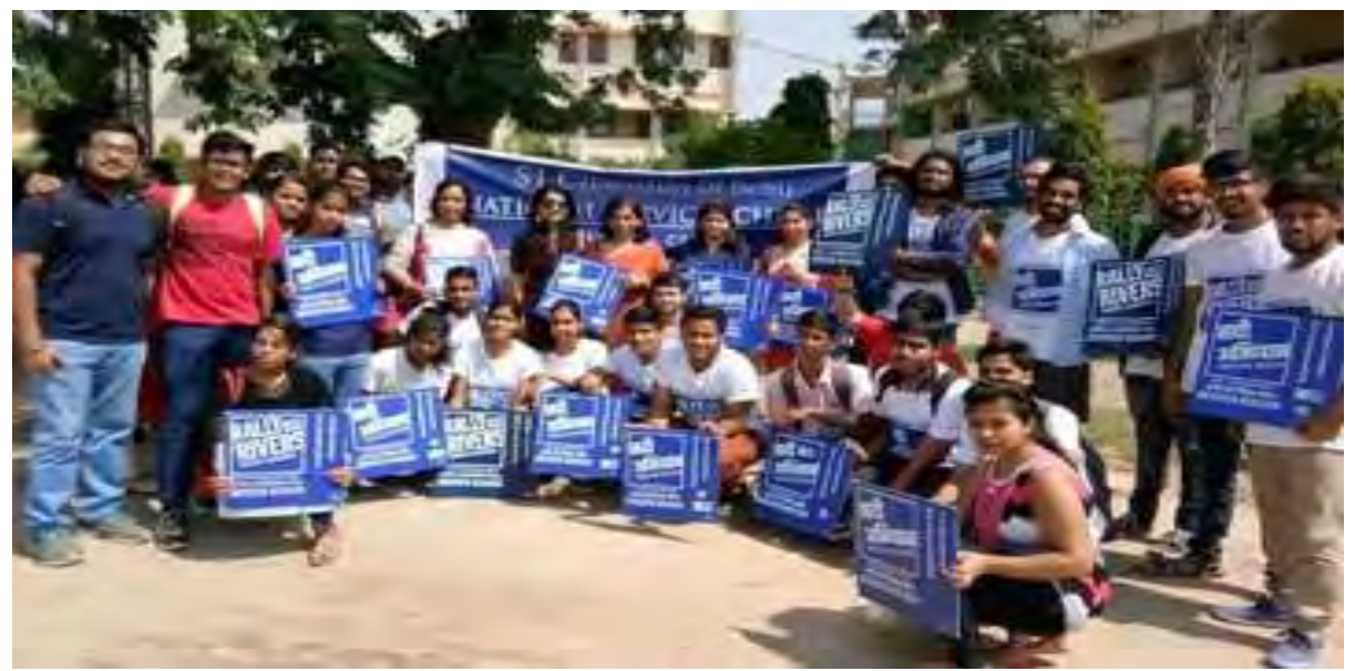
26 September, 2017

NSS Day was celebrated with great enthusiasm on 26, September 2017. The day started with an absolutely amazing street play performed on Protecting Rivers And Rejuvenating Them Via Afforestation by the volunteers from —Rally for Rivers" Organisation, which was enjoyed by the students and also taught them the value of rivers and forests. It was followed by a debate competition and an essay writing competition on the topic of Saving Rivers and their importance. Active participation was seen from the students in both the competitions which indeed boosted their morale and helped them to realize that every drop of water is important and how to save it.