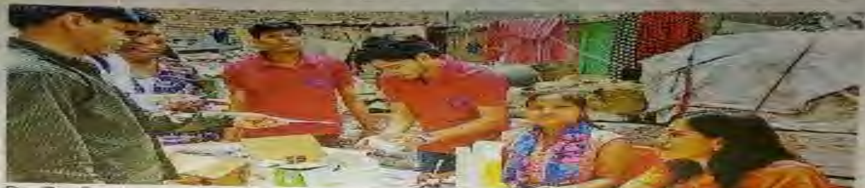
झिलमिल स्थित हनुमान सेवा बस्ती में लगे स्वास्थ्य त्रिविर में जांच कराते लोग 🍽 आग्रास्थ

जागरण संवाददाता, पूर्वी दिल्ली : खाइदग स्थित दिल्ली विश्वविद्यालय के श्यामलाल कॉलेज राष्ट्रीय सेवा योजना की टीम ने स्वस्थ समाज के उद्देश्य से दो दिवसीय निशुल्क स्वास्थ्य जांच शिविर लगाया। यह कर्मक्रम कॉलेज की प्रमुप्तस्य टीम ने राष्ट्रीय चिकित्सा संस्थान (प्रनुप्तम्ओ) तथा सेवा भारतीय के साथ मिलकर आयोजित किया। जिसका