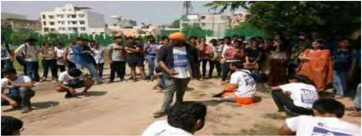
With continuing this NSS unit introduced Rally for rivers campaign to create awareness about protecting rivers and rejuvenating them on 27 September, 2017. Class to class awareness

NSS Day was celebrated with great enthusiasm on 26, September 2017. The day started with an absolutely amazing street play performed on Protecting Rivers And Rejuvenating Them Via Afforestation by the volunteers from —Rally for Rivers" Organisation, which was enjoyed by the students and also taught them the value of rivers and forests. It was followed by a debate competition and an essay writing competition on the topic of Saving Rivers and their importance. Active participation was seen from the students in both the competitions which indeed boosted their morale and helped them to realize that every drop of water is important and how to save it.