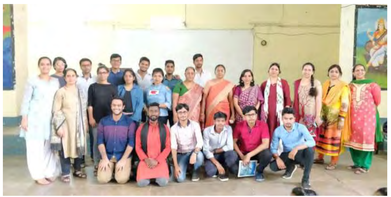
Govt. Sarvodaya Kanya Vidyalaya

The NSS volunteers performed a skit in Govt. Sarvodaya Kanya Vidyalaya and Govt. Sarvodaya Bal Vidyalaya Memorial School, at around 12:30 and 2:00 in the afternoon respectively.