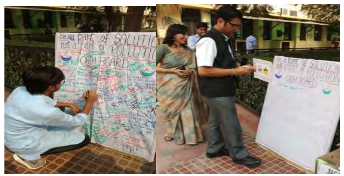
based on their requirement. Both the events were a grand success as the team received a number of books and many students took the oath of pollution-free Diwali.

The principal encouraged the NSS team for their efforts and signed the oath board. Many other teachers and non-teaching staff also donated a number of books and signed on the oath board. The NSS unit sent the books collected in the donation camp to Guzarish – Books for All, a social mutual fund from where the books would be shipped to a number of NGOs