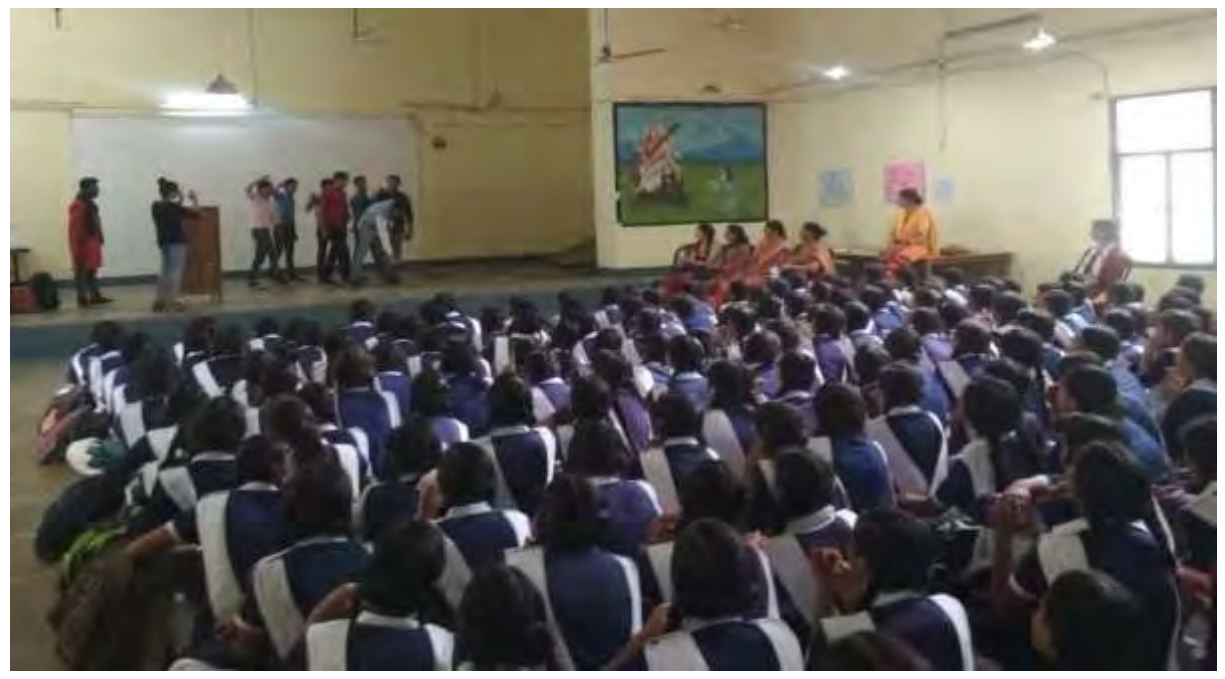
Govt. Sarvodaya kanya Vidyalaya

The event was successful as the students of both the schools enjoyed the play very much. They showed great interest. The event ended on a good note and learned the importance of health and hygiene in their surroundings.